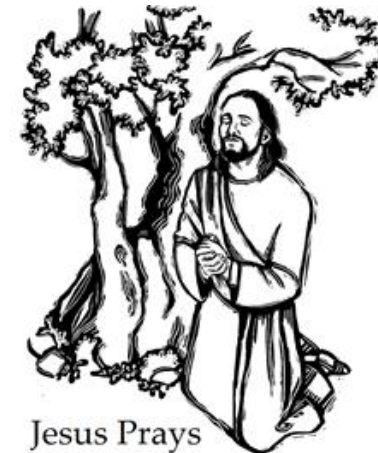
Jesus Prays for his disciples.