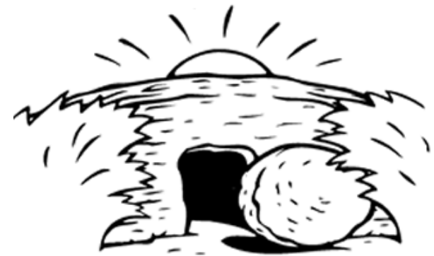
"He has risen! He is not here." Mark 16:6