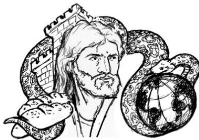
The Temptation of Jesus