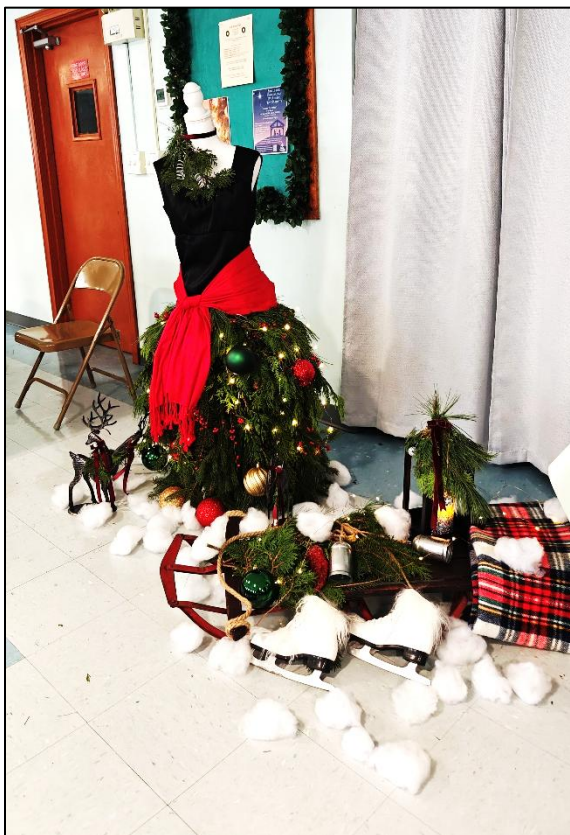
Garden Club of Forest Hills celebrated their annual Christmas party in our Fellowship Hall in December.