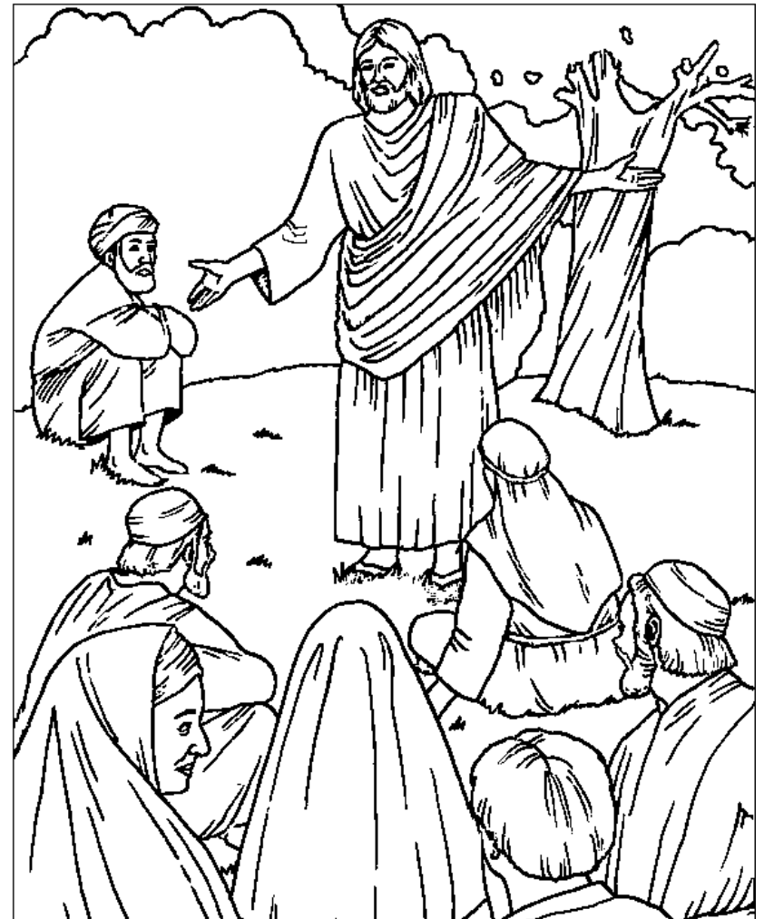
The Sermon on the Mount Matthew 5:1-12

From BibleStoryCard Learning System(tm) Coloring Book © 1996 Wesleyan Publishing House. Used by permission. Additional BibleStoryCard resources are available by calling 1-800-493-7539 or visiting online http://www.wesleyan.org/941/biblestorycards