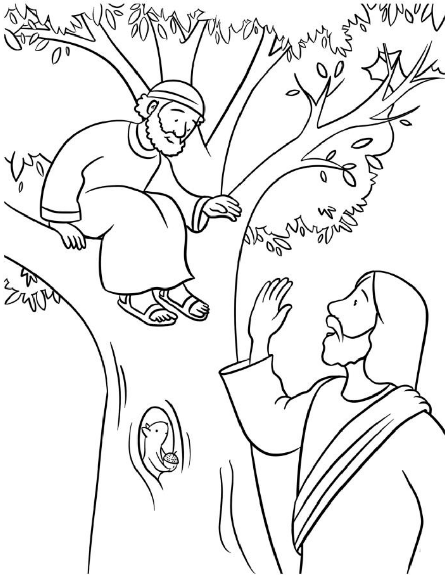
Jesus and Zacchaeus Luke 19