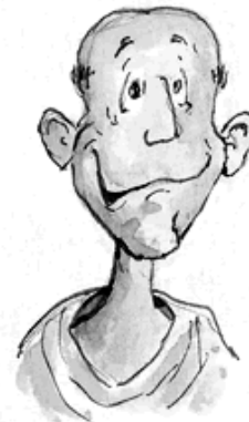
Zacchaeus