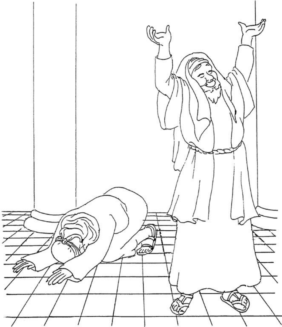
The Parable of the Pharisee and the Tax Collector