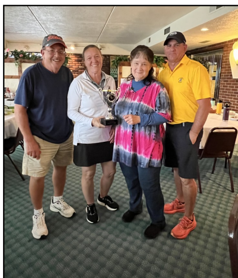
The highest scoring team of the outing