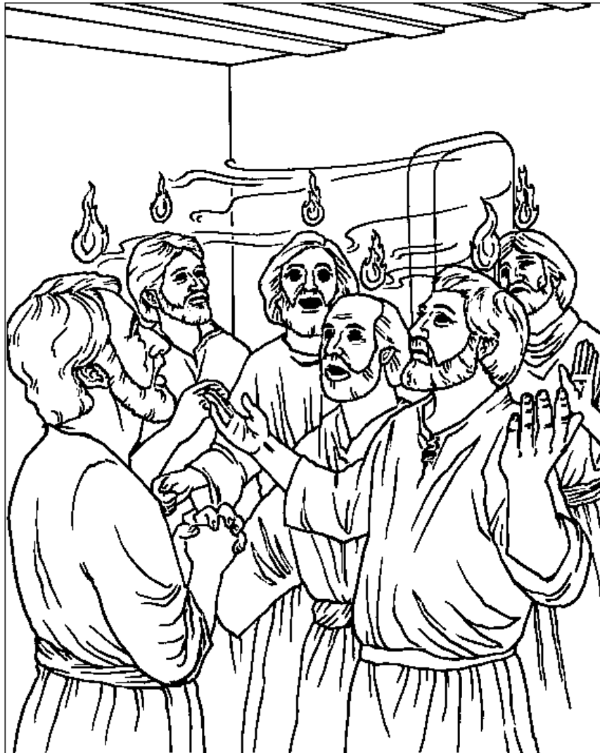
The Day of Pentecost Acts 2

Thru-the-Bible Coloring Pages for Ages 4-8. © 1986,1988 Standard Publishing. Used by permission. Reproducible Coloring Books may be purchased from Standard Publishing, www.standardpub.com , 1-800-323-5473.