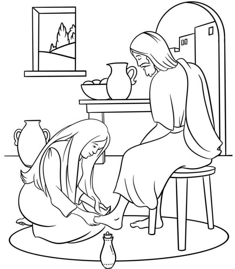
Mary Anoints Jesus' Feet John 12:1-8

Then Mary took about a pint of pure nard, an expensive perfume; she poured it on Jesus' feet and wiped his feet with her hair. John 12:3a (NIV)