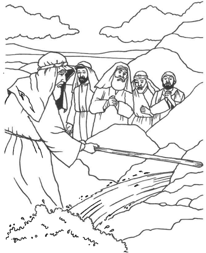
Moses Strikes the Rock Exodus 17:1-7

From BibleStoryCard Learning System(tm) Coloring Book © 1996 Wesleyan Publishing House Used by permission. Additional BibleStoryCard resources available by calling 1-800-493-7539 or visiting online http://www.parable.com/wph/group_1052.htm