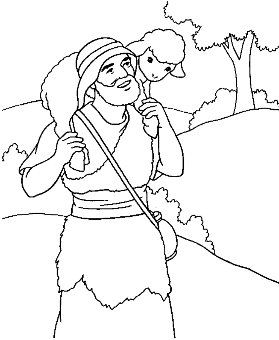
The Parable of the Lost Sheep