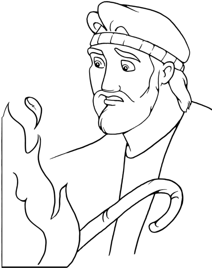
Moses and the Burning Bush Exodus 3:1-15