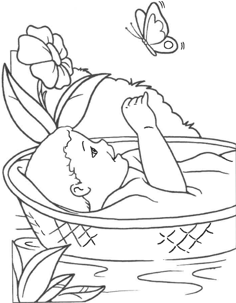
The Baby Moses by the River