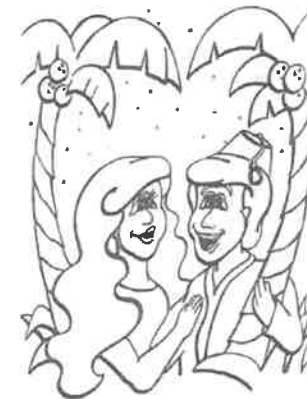
Isaac and Rebekah