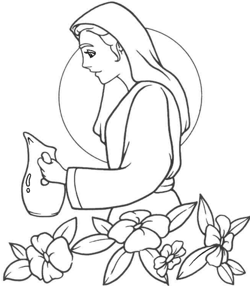
A Bride for Isaac Genesis 24:1-67