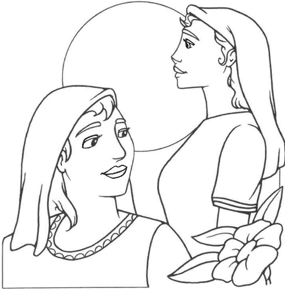
Leah and Rachel

Now Laban had two daughters; the name of the older was Leah, and the name of the younger was Rachel.