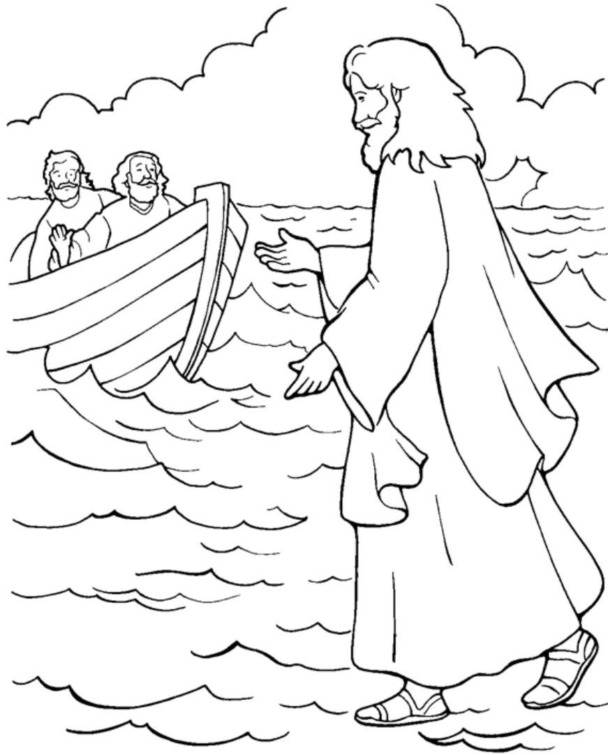
Jesus Walks on Water

From Thru-the-Bible Coloring Pages for Ages 4-8. © 1986, 1988 Standard Publishing. Used by permission. Reproducible Coloring Books may be purchased from Standard Publishing, www.standardpub.com, 1-800-543-1301.