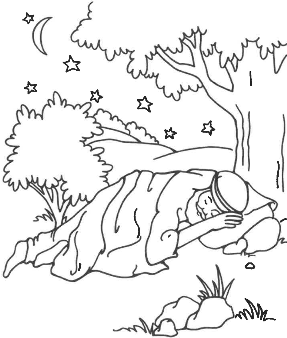
God Cares for Jacob

From Thru-the-Bible Coloring Pages for Ages 4-8. © 1986, 1988 Standard Publishing. Used by permission. Reproducible Coloring Books may be purchased from Standard Publishing, www.standardpub.com , 1-800-543-1301.