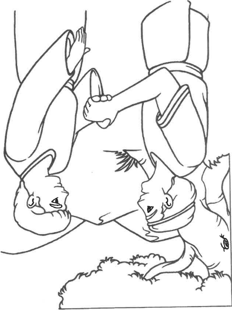
Esau Sells His Birthright to Jacob Genesis 25:19-34