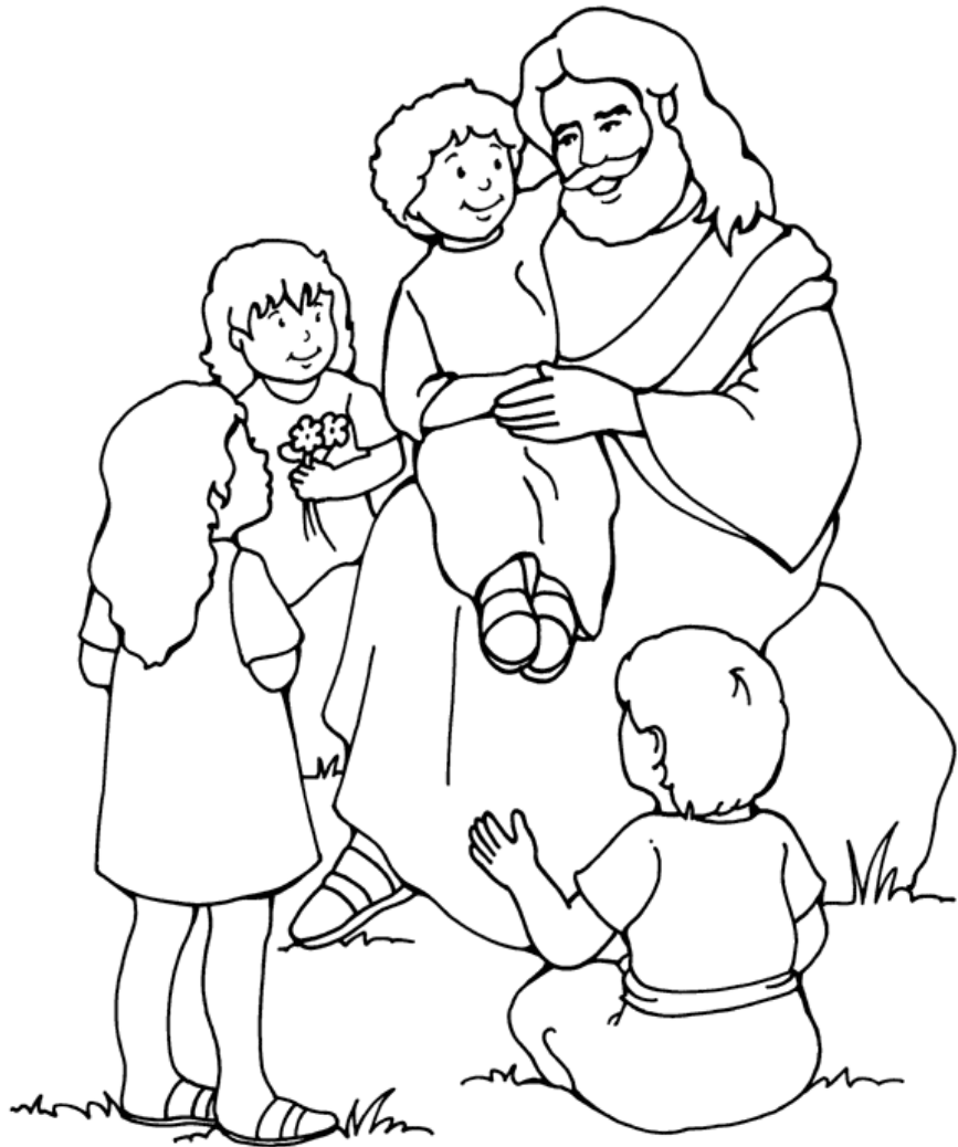
Jesus and the Children

Each number represents a letter of the alphabet. Substitute the correct letter for the numbers to reveal the coded words.