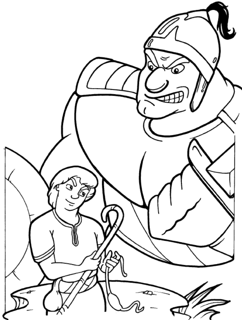
David & Goliath 1 Samuel 17:32-49