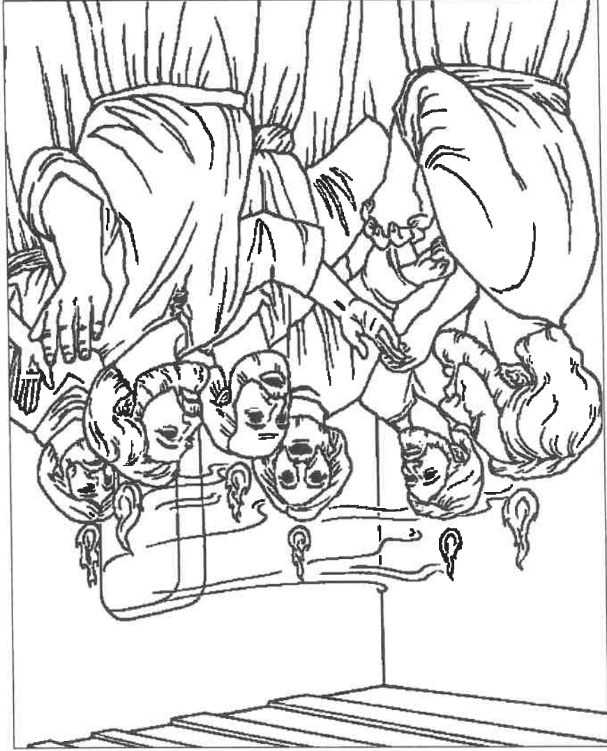
The Day of Pentecost Acts 2

Thru-the-Bible Coloring Pages for Ages 4-8. © 1986, 1988 Standard Publishing. Used by permission. Reproducible Coloring Books may be purchased from Standard Publishing, www.standardpub.com, 1-800-543-1301.