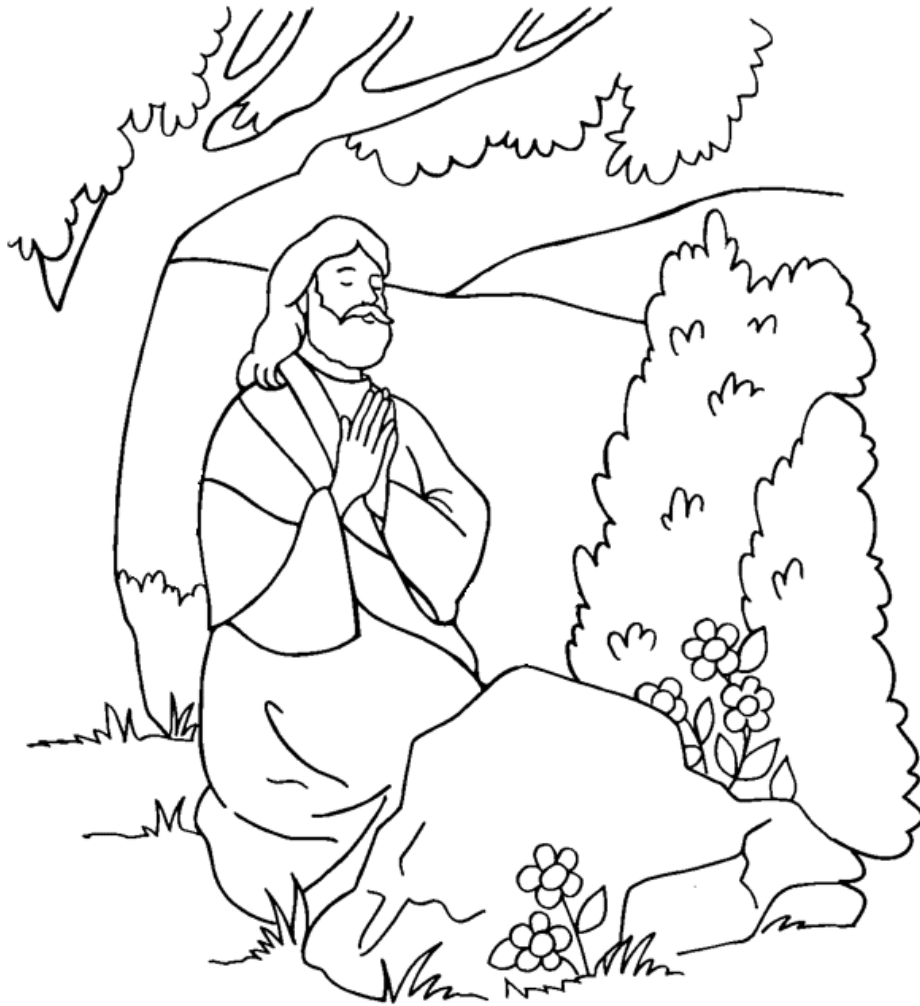
Jesus Prays for His Disciples