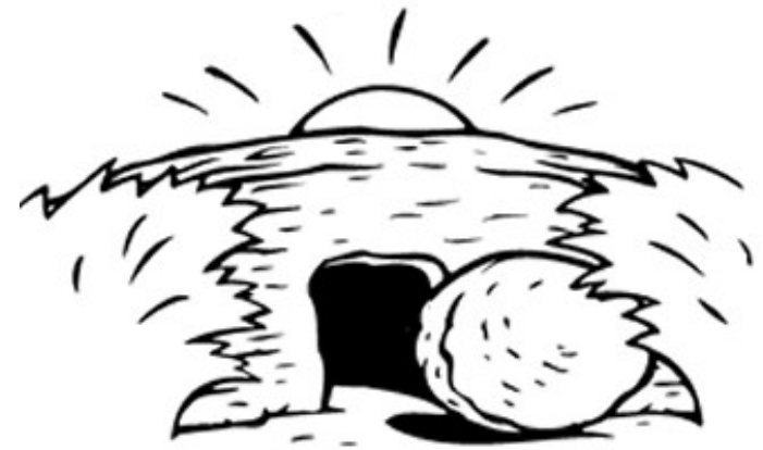
"He has risen! He is not here." Mark 16:6