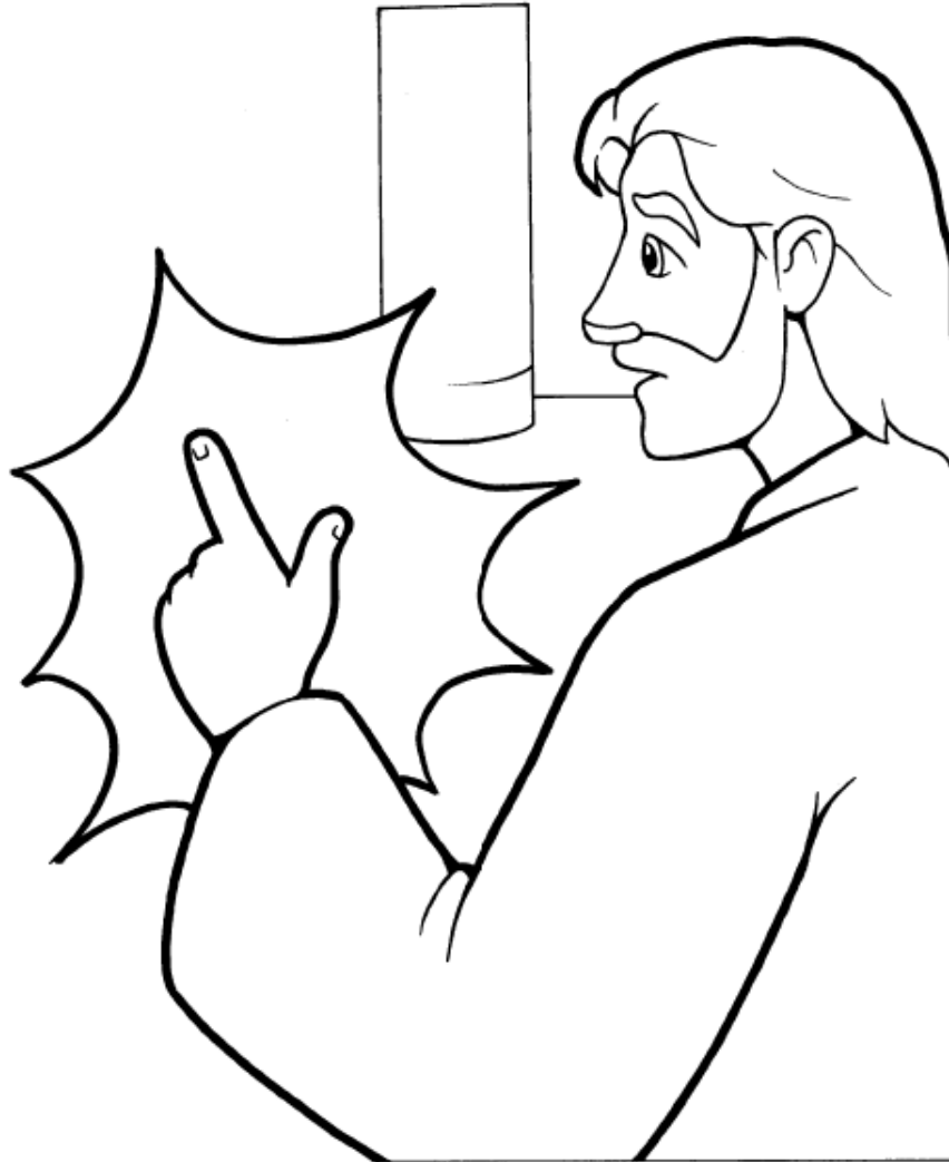
Jesus Appears to the Disciples

Copyright © CalvaryCurriculum.com Used by Permission