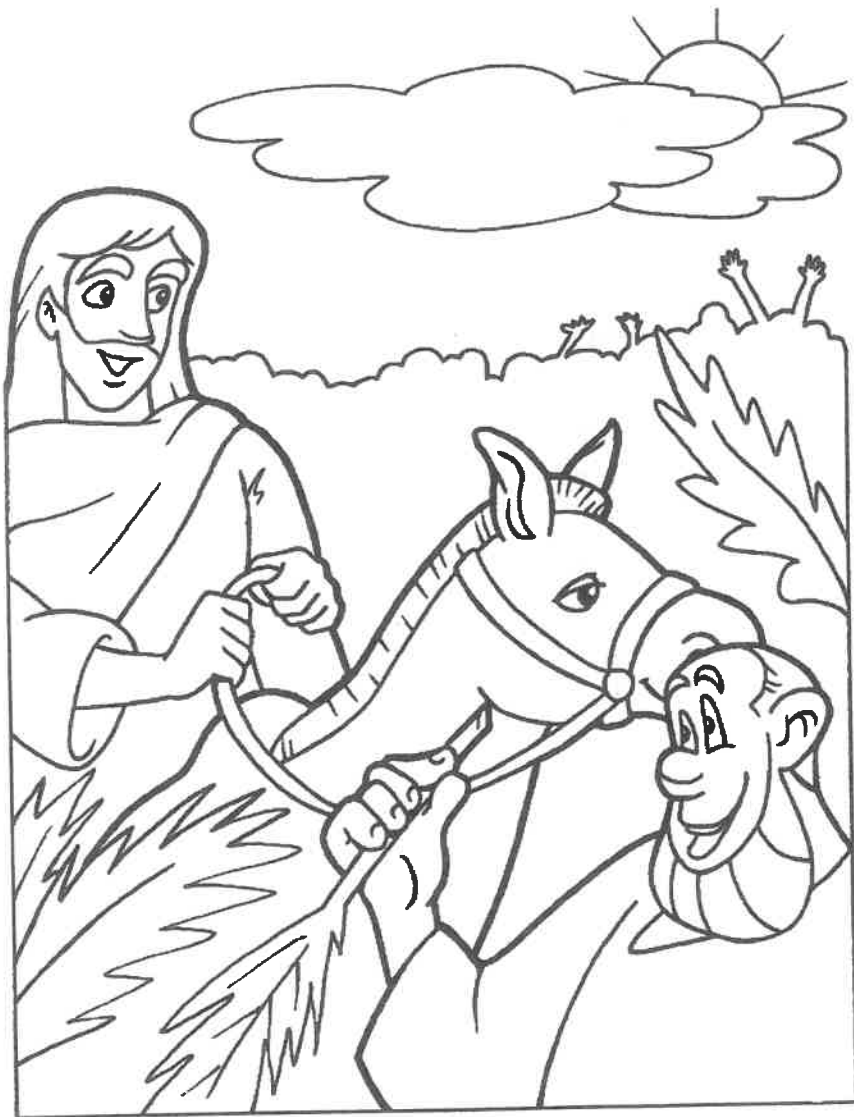
The Triumphal Entry