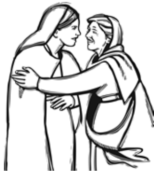
Mary Visits Elizabeth