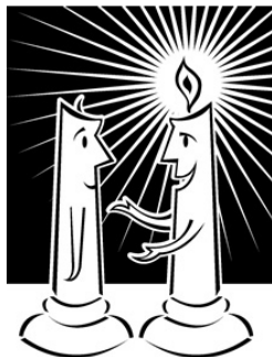
Jesus Is the Light