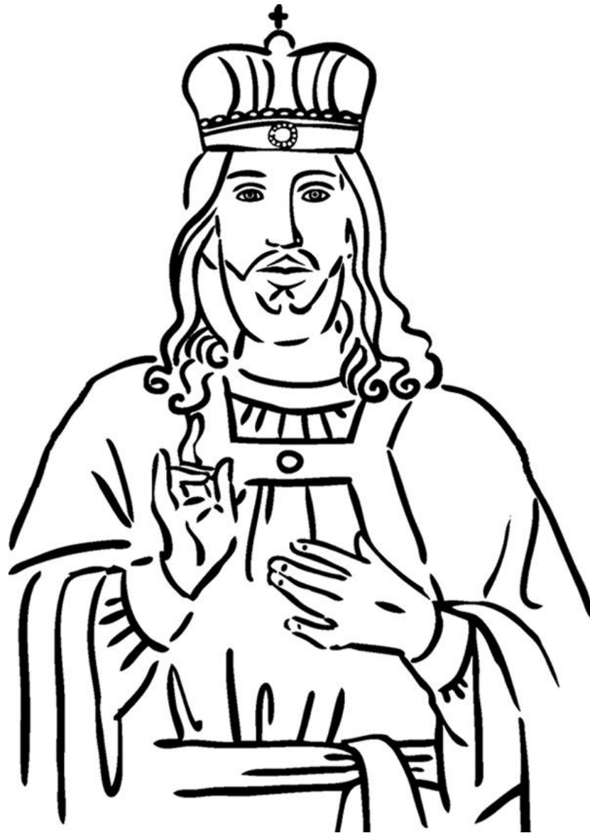
Christ the King John 18:33-37

Each number represents a letter of the alphabet. Substitute the correct letter for the numbers to reveal the coded words.