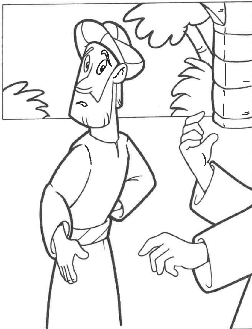
The Rich Young Ruler